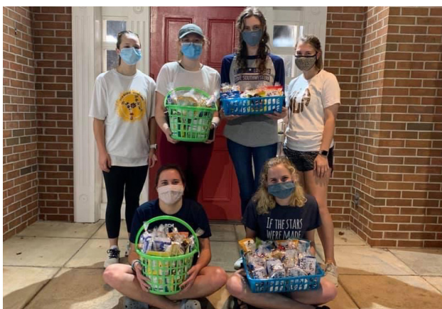
Campus outreach with BCM.