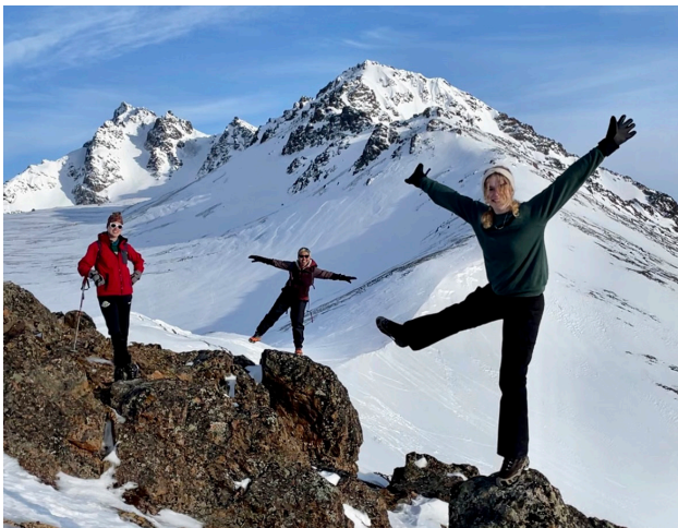
Hiking on the top of Little O'Malley Peak in Anchorage.