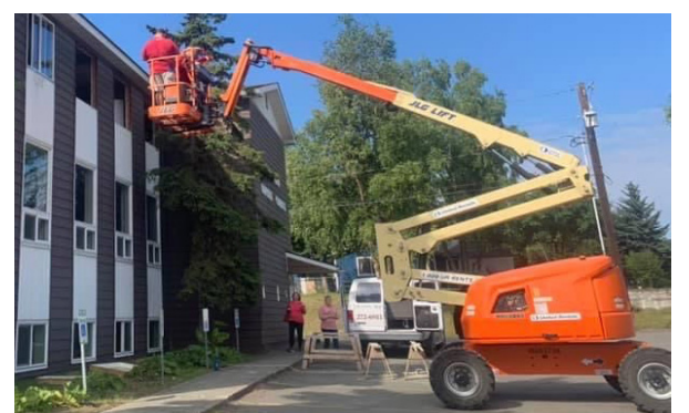
Construction efforts during the Alaska summer mission trip.