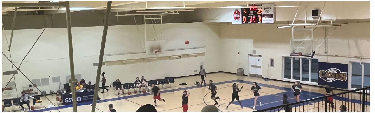
The BCM Warriors compete against the Tunnel Vision.

Intramural basketball season kicked off on January 23. There were two games: one at 7:00 and another at 8:15. The 7:00 opening game was between the Bluestrips and the 94 Feet Elite, and it ended in a narrow victory for 94 Feet Elite, who won 41-40 against the Bluestrips.