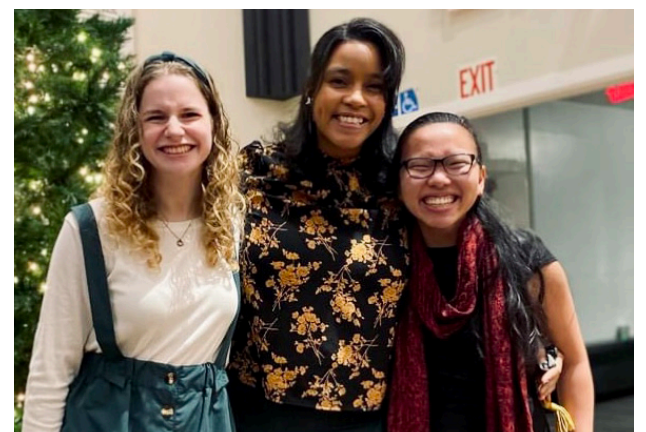
First Christmas living in Alaska.