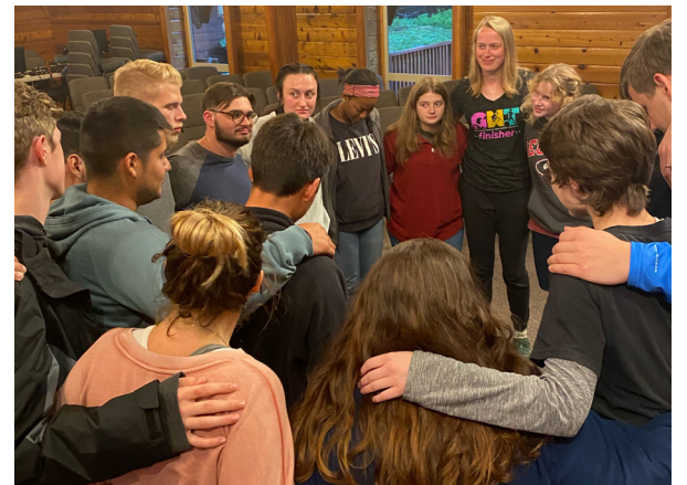
All 17 interns gather and pray in Kodiak, Alaska.