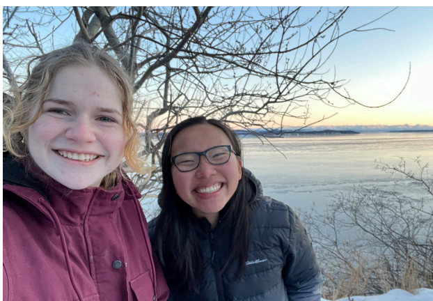
6 AM sunrise walk at Knicade Beach with a fellow UAA student.

a counselor, which is one of my favorite things to do. I also get to do all of the accounting and H.R. and scheduling and all of the technical numbers and small details that keep a business running."