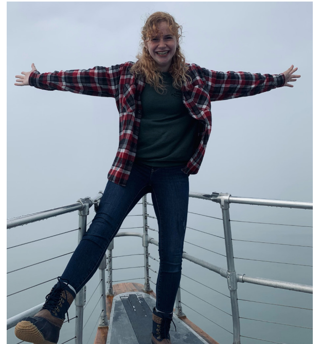
Church service on a boat in Vakdez, Alaska, during her summer mission trip.