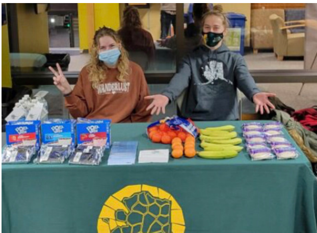
Campus outreach with Mosaic.