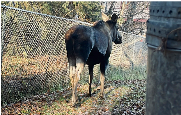
A moose caught relaxing in Elle Kluksdahl's backyard.